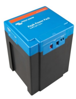
12.8 V, 40Ah