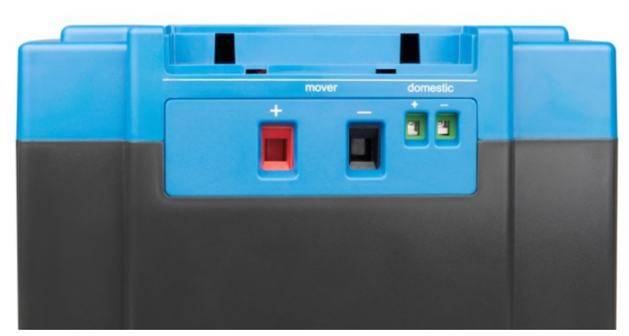
High capacity output (mover) and low capacity output (domestic)