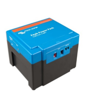
12.8 V, 20Ah