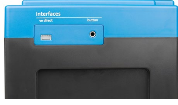
VE.Direct and push-button