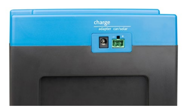
Adapter and car/solar inputs (plug for the car/solar input is included)