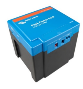
12.8 V, 30Ah